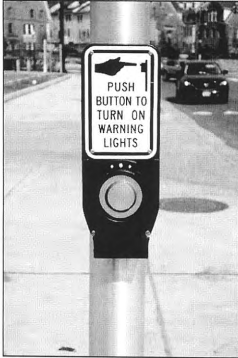
Figure 3. Example of pedestrian pushbutton and R10-25 sign with pilot light for pedestrian actuation.

cc: Associate Administrators Chief Counsel Chief Financial Officer Directors of Field Services Director of Technical Services