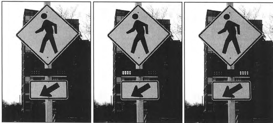
Figure 1. Example of an RRFB dark (left) and illuminated during the flash period (center and right) mounted with W11-2 sign and W16-7P plaque at an uncontrolled marked crosswalk.